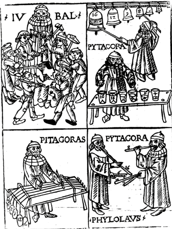
Figure 1. Pythagoras doing experiments with various different instruments. Woodcut [8].